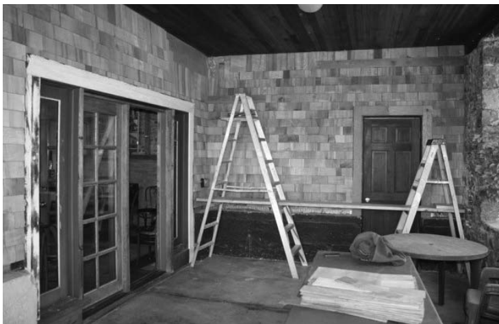
The veranda area on the front of the house is being resingled.

Doug, Chuck Fields & Bob Rhodes took on the restoration of the Storeroom floor at the North Star House this week. The room had a bathroom added to it some decades in the past and had many leaks which caused extensive water damage. The timbers were treated for bugs and new beams were "sistered" to the originals. Shims were custom cut to allow the new, temporary floor to be flush with the rest of the room.