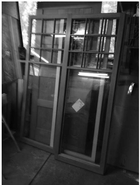
New custom windows for the living room - Bo Kleiger, our multi-talented property manager, has custom built Craftsman style windows for the living room.