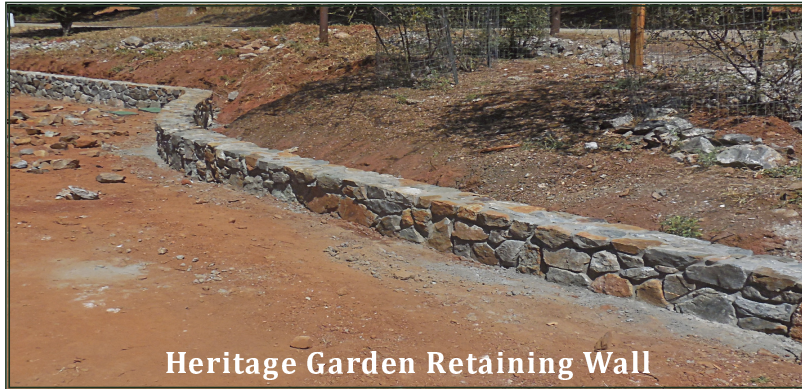
Heritage Garden Retaining Wall

The next step is a second round of site grading to be accomplished in late October as well as the concrete pad for the garden shed. It is hoped that the garden shed will be built and the fence posts set prior to the predicted rainy season.