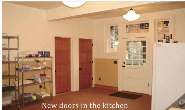
New doors in the kitchen

Catering kitchen floor installed Kitchen painted Utility sink installed in the kitchen Office doors hung Bathroom fixtures for all three bathrooms installed