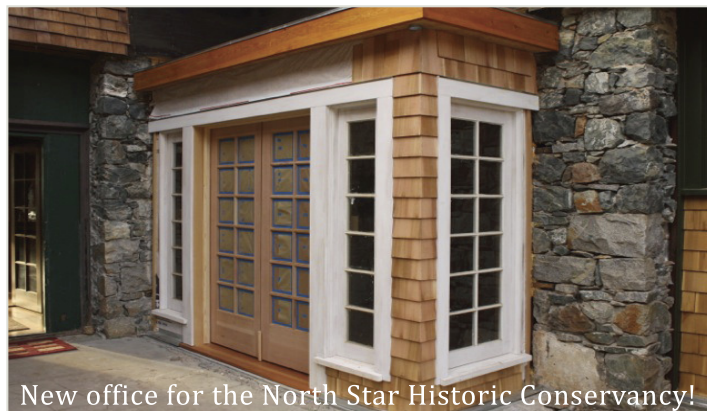
New office for the North Star Historic Conservancy!