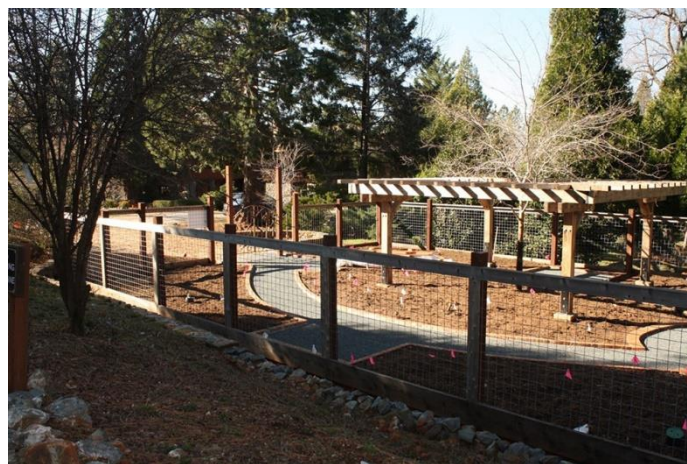
The East elevation

Gratitude and props to local Rotary and Soroptimist volunteers whose invaluable efforts (including the planting still to come) have helped us realize our vision for the Heritage Garden. We are excited to invite you to the Garden's "ribbon cutting" during our June 23 "Heritage, History and Hops" event.